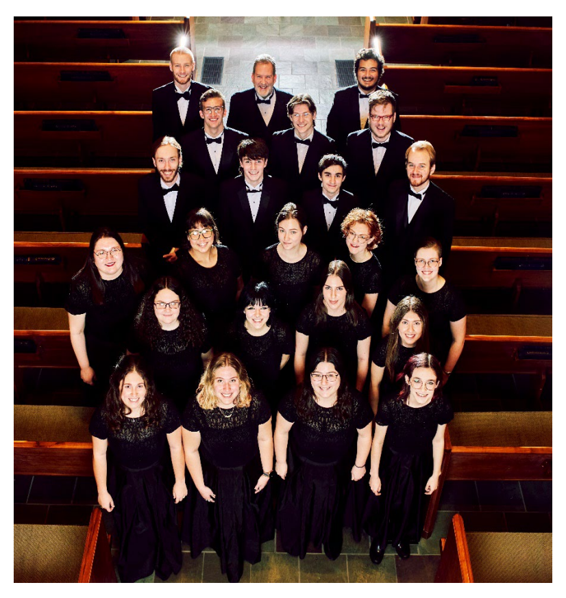
TU Cappella Chamber Singers

Students are required to return music and university equipment at the time and place designated by the conductor. Students who do not return music and equipment in a timely fashion will receive a grade of "F" and have the replacement cost of the music or equipment billed to their university account.