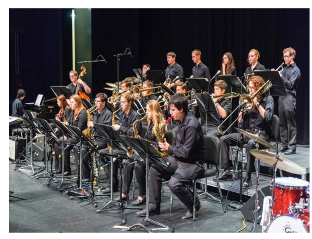
TU Jazz Ensemble

The School of Music considers specific criteria when offering or renewing financial awards for continuing music majors. For you to retain a current award or be considered eligible for future awards, you must pass the applied jury, and demonstrate professionalism and quality performance in all the ensembles and studio lessons to which you are assigned. Non- music majors receiving music scholarships must demonstrate professionalism and quality performance in their ensembles to qualify for continued aid.