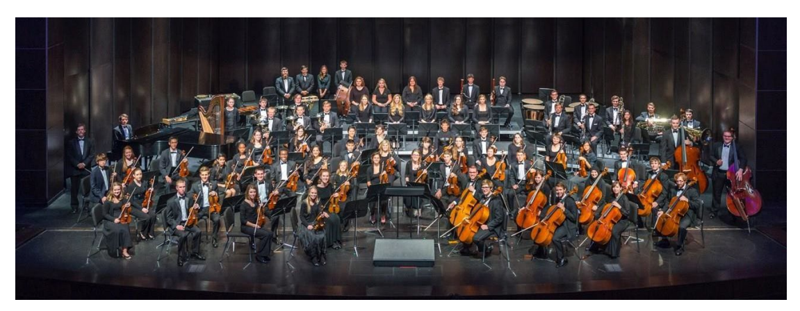
TU Symphony Orchestra

Suggested documentation of performances: audio or video recording of the performance, the program, scores of original compositions by the student if applicable, and program notes written by the student.